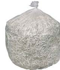
Shredded Paper in Clear Bag