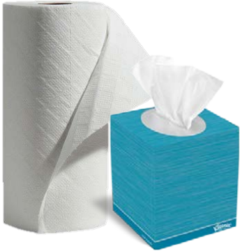
Paper Towels & Tissues