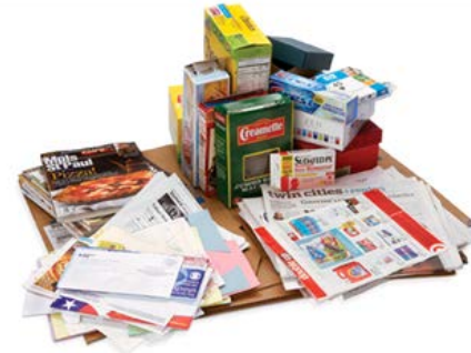
Paper & Cardboard