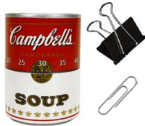
Cans & Other Metals